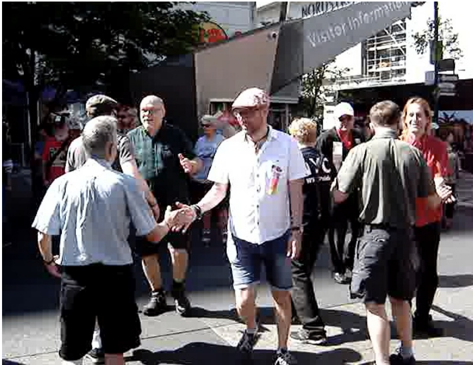
A “still” from our brilliant film!

We extended our dance season until the third week into June. This gave our new “beginners”, who had started in January, a chance to keep dancing and finish the complete Basic list. Well done folks!