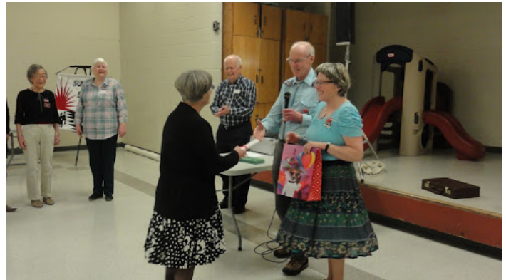
Graduates receiving their diploma