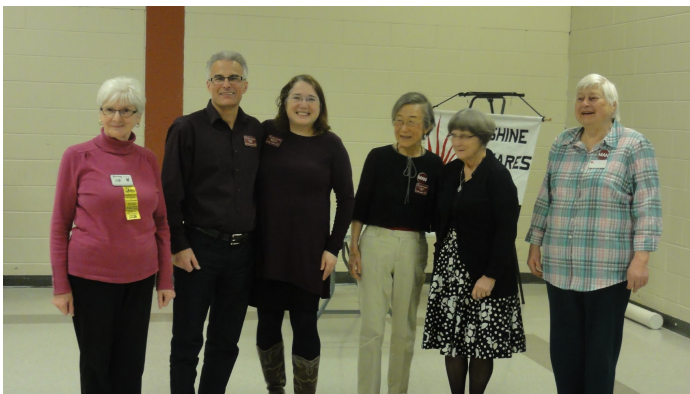
Sunshine Squares Graduating Class 2016