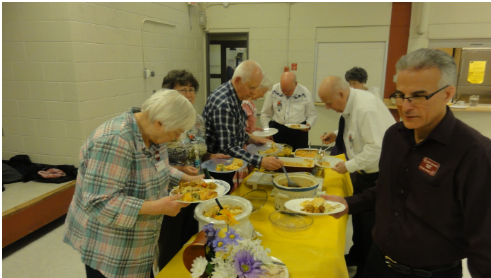
Down to the serious business of eating